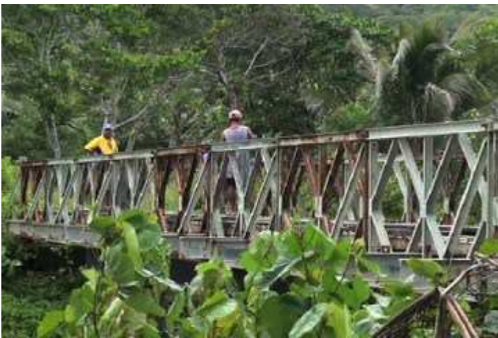
Misima mine failed to deliver benefits for local people

21 February 2014