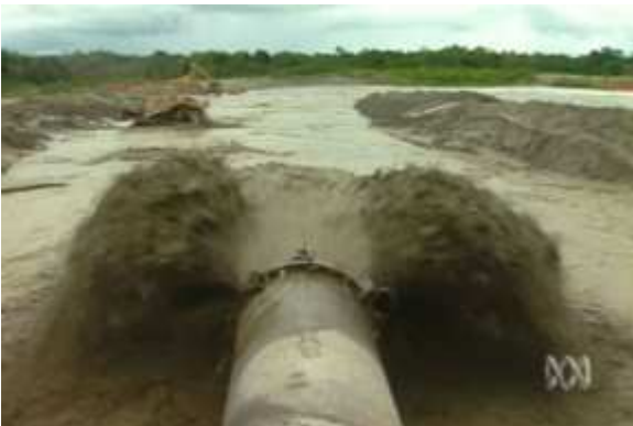
OK Tedi mine pipe spewing waste into Papua New Guinea river. [File]

Post Courier via PNG Mine Watch 17 February 2014