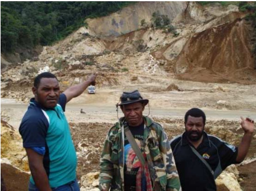
Villagers in Papua New Guinea point to their village destroyed in a landslide from a quarry being excavated for a liquefied natural gas project.

Catherine Wilson, IPS, via PNG Mine Watch 23 February 2014