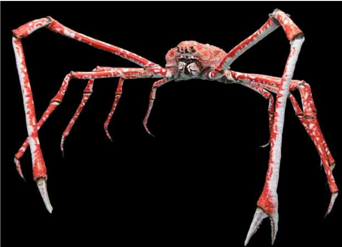
Spider crabs are as much as 4 metres across and a metre high.