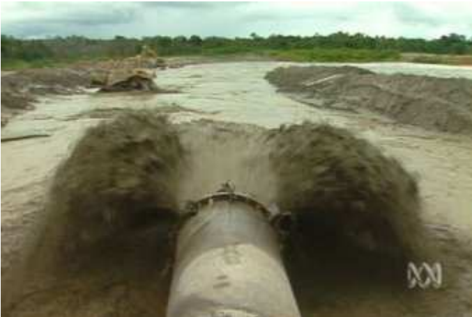
PHOTO: A pipe from the Ok Tedi mine pours waste into the Ok Tedi river

TONY EASTLEY: Papua New Guinea's National Court has ordered the Ok Tedi mining company to stop dumping waste into a local river - a move that would effectively shut down the mine. The court has also ordered that company bank accounts be frozen after allegations were made that money earmarked for local development had been mis-used.